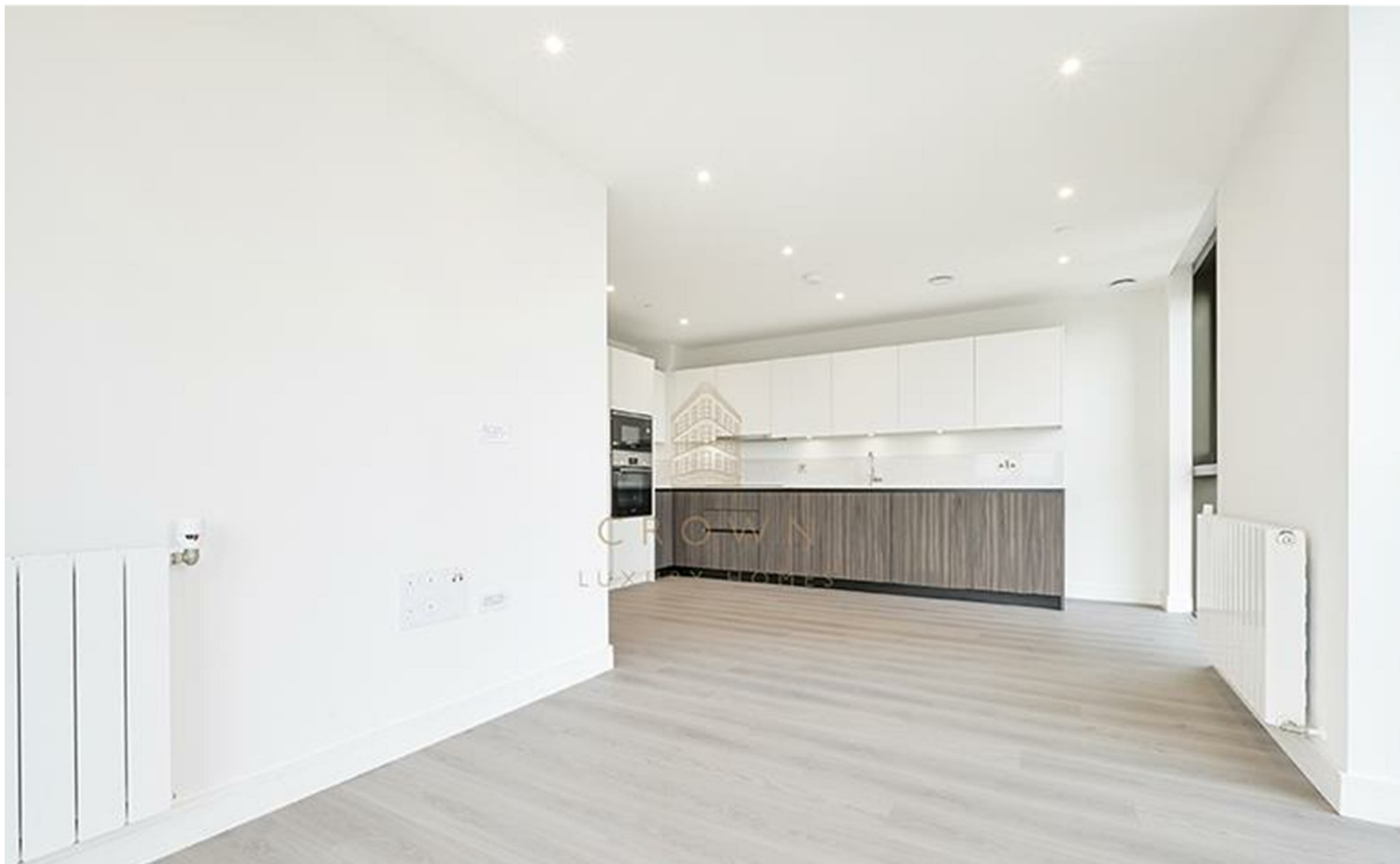
1902 Menara Point 1 Affinity View, London, E16 4EE £2,500